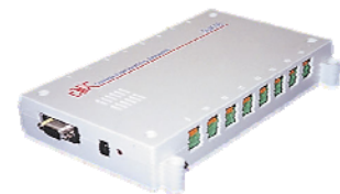
PA-16 PageAlert module