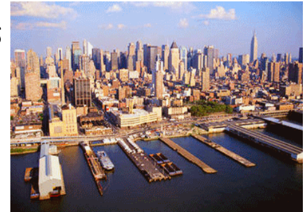
List of canned messages