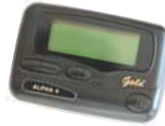
ALPHA 4 GOLD pagers