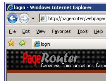
People log into WebPager using a browser to send messages from unlimited computers via the Intranet or the Internet.