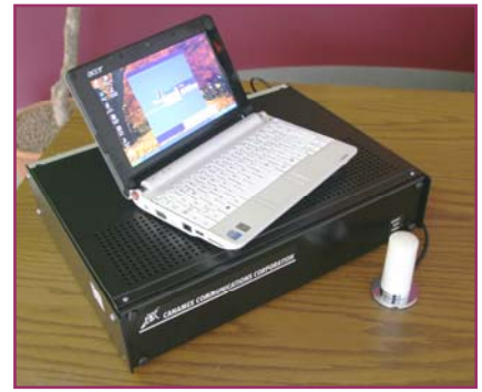
Antenna delivered with 50 ft. cable. Install antenna as high as possible for maximum paging range (1 to 10 miles depending on terrain and antenna height).