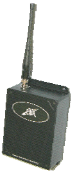
DigiPager Link transmitter