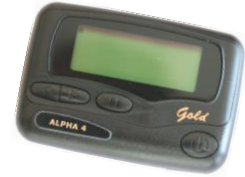
ALPHA 4 GOLD pagers